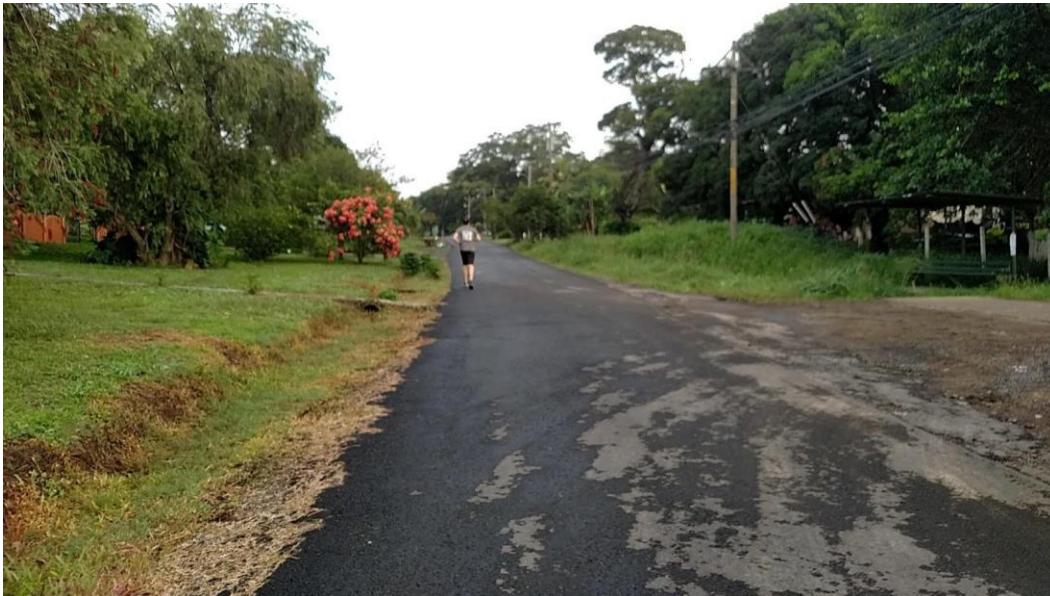
FIGURE (2): PHOTO OF THE LONG ROAD LEADING TO THE CENTER. UPON CLOSER EXAMINATION, THERE ARE WALKWAYS AND GATES LEADING UP TO HOUSES THAT ARE SET BACK FROM THE STREET

The academic programs of the Field Research International are all based in The Center. The Center contains a wealth of resources with a residence hall, classroom space, dining area, apartments for faculty and visitors, a soccer field, swimming pool, organic farm, and more. The students live, eat, take classes, and play at the center for either a semester or a month-long summer program. Students can leave the Center during the day when they have free time; however, they must return by a designated curfew. The curfew illustrates the tension the administration of The Center faces trying to promote the safety and security of the students but implementing something that may be seen by community members as potentially limiting opportunities for interactions later in the evening. Frequently, when students leave The Center, they either go for a run, a short walk to buy ice cream from a local vendor, or are meeting a taxi to drive them downtown.