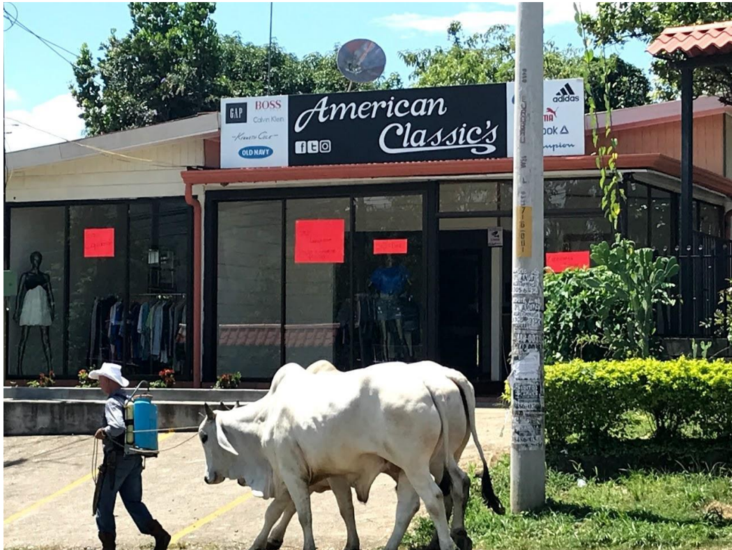
FIGURE (1): PHOTO OF A LOCAL FARMER WALKING CATTLE THROUGH THE CENTRAL COMMERCIAL AREA OF PACIENCIA, COSTA RICA. WHILE NOT A REGULAR SIGHT, IT IS NOT UNCOMMON TO SEE THIS COLLISION OF CITY AND FARM IN TOWN

As a town, Paciencia shares a split identity of being close to the capital city of San Jose and yet being far removed and away from the busyness of the big city. Paciencia has a population of nearly 30,000 and is about a one-hour drive from San Jose within Costa Rica's central valley. It has a downtown with a park and church at its center, as is the case of most Central American towns and cities, but is also surrounded by hills, forests, and farms.